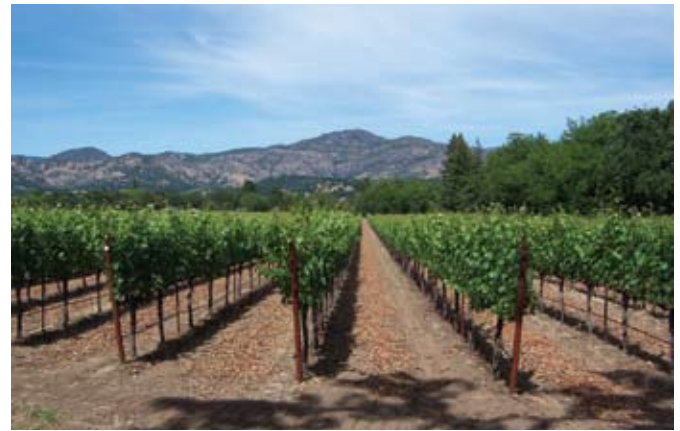
Oak Knoll Vineyards

This is not your typical Napa Chardonnay. By combining the characteristics that both traditional barrel fermentation and stainless steel ferment provide, we were able to retain the delicious tropical fruit flavors, while also giving the customer what they have come to love in Chardonnay—creamy notes, toast, spice and vanilla without being overdone in any way. “No stick of butter and a 2 x 4 Chardonnay here!” Very food friendly and crowd pleasing!